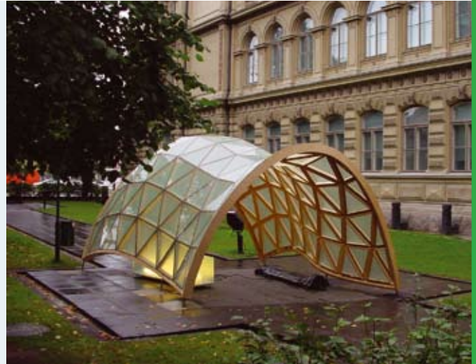
Use of ICT 3D Measuring Techniques for High Quality Construction

possible to modify a product or production system during its life-cycle, to improve its properties or add or activate new features by means of software modifications or plug-ins that can be supplied online. The changes required and opportunities offered by the information and service society in the life-cycle management of the existing built environment will be even greater than those seen in the construction process.